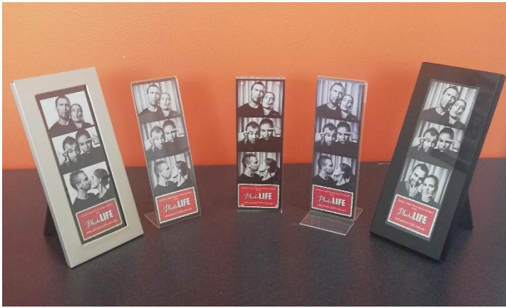
Photo Booth Products

Coral Coast Photo Life also has a full range of photo-strip frames to suit any budget - from acrylic fridge magnets and L-shaped frames to easel-backed metal strip-frames in either silver or classic black.